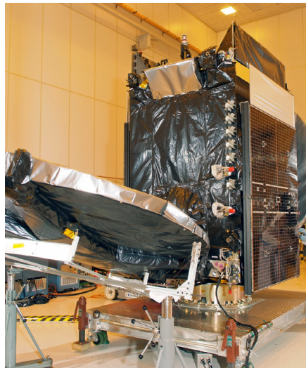
Horizons-2 in Orbital ATK's Dulles, Virginia satellite manufacturing facility