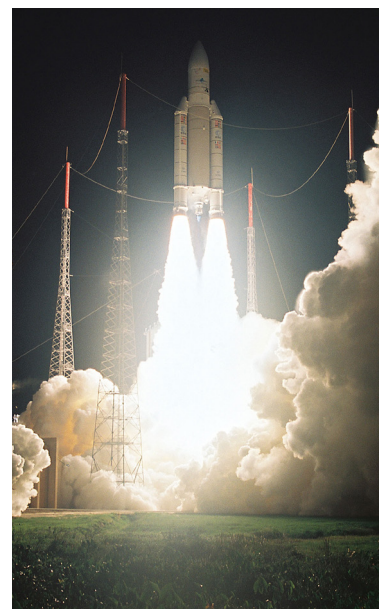
Optus D2 was launched aboard an Ariane 5 rocket in 2007.