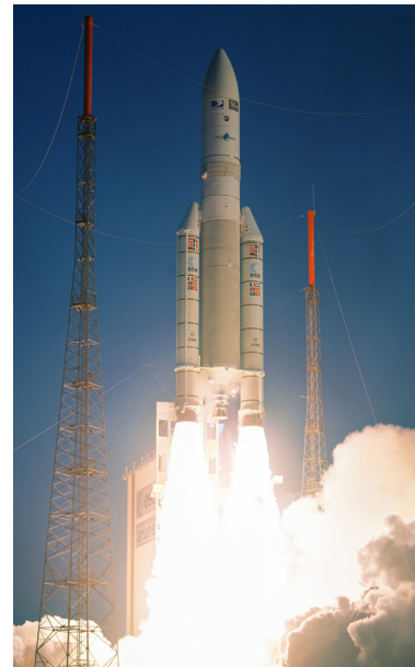
Optus D1 was launched aboard an Ariane 5 rocket in 2006.